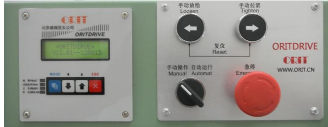
Digital tension setting